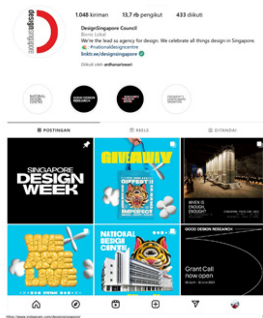
Figure 1. Design Singapore Council Instagram account

Conversely, the success of branding Bandung as a creative city depends on the creative community's extant human resources. Bandung is a creative city where cultural activities are integrated with economic and social activities (Fitriyana, 2016). Therefore, Bandung Creative City Forum (BCCF) was established for community groups to create and collaborate to foster a sense of community (interviewed with Tita Larasati, Chairperson of BCCF, 2023). BCCF comprises individuals who share the goals of establishing Bandung as a creative hub and ensuring the city's progress (Lumbantoruan, Mulyana, & Santoso, 2021). It assisted the government in branding Bandung as a creative city through various events.