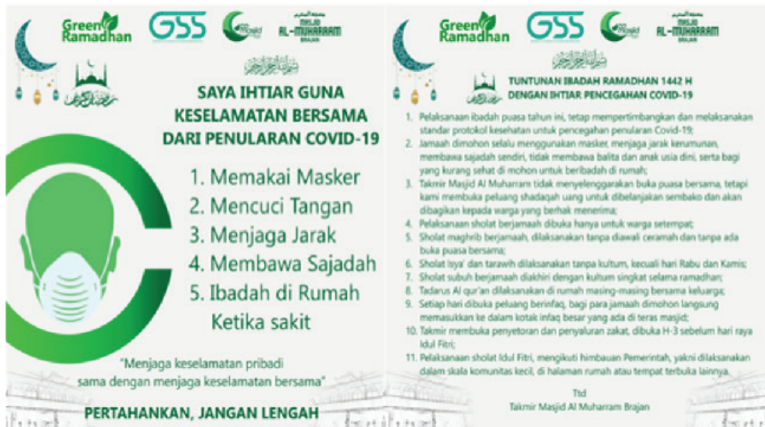
Figure 3. Communication Safety Efforts from COVID-19 Transmission

providing socialization of public health. As well as religious leaders as communicators in health communication for preventive activities for the spread of COVID-19 it is important to understand the use of media and the context of the message to be conveyed. As the results of this study were also strengthened by previous research (Muchammadun et al., 2021) which stated that citizen compliance with the COVID-19 health protocol was greatly influenced by the role of social media, advice from religious leaders, demographic characteristics of the population and enforcement of regulatory rules and policies.