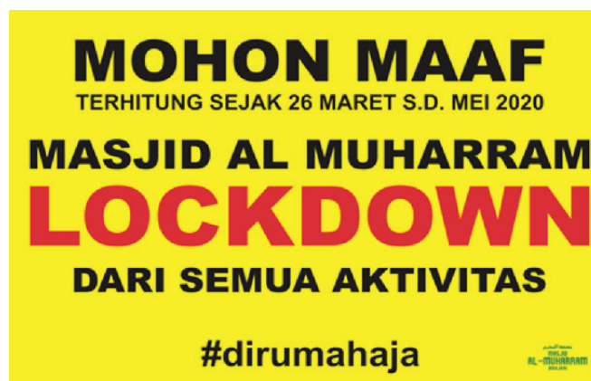
Figure 1. Preventive Communication on Closing Policy of the Al-Muharram Mosque

social media which can increase people's interest in reading (Rahmawati et al., 2020)