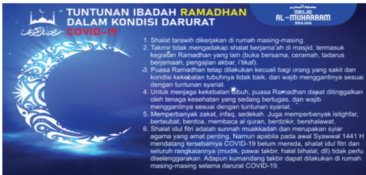
Figure 3. Preventive Communication on Giving Appeals to Mosque Congregation

that the existence of the COVID-19 pandemic with various information media channels made people feel afraid and angry. Then the second strategy, providing space for activities and opening the congregation, would positively impact the congregation and mosque activities. In many cases, mosques were abandoned since their congregation looked for other mosques to accommodate their 'desire' for worship.