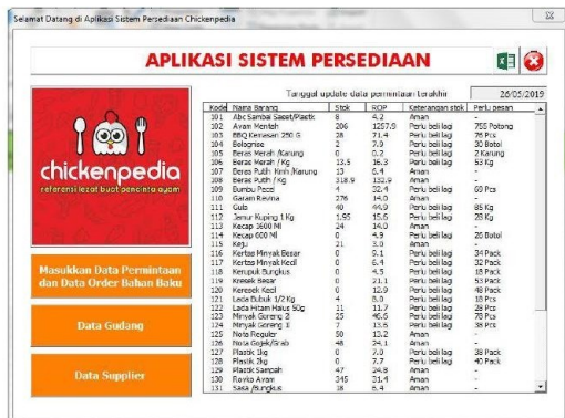
Figure 2. Home page