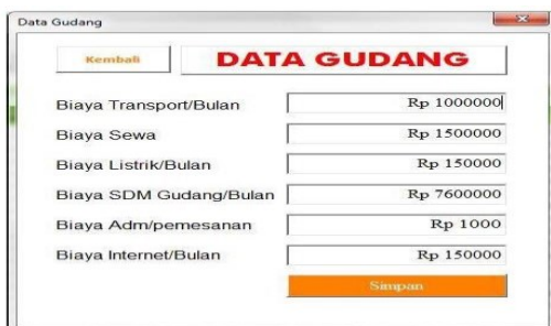
Figure 6. Warehouse data