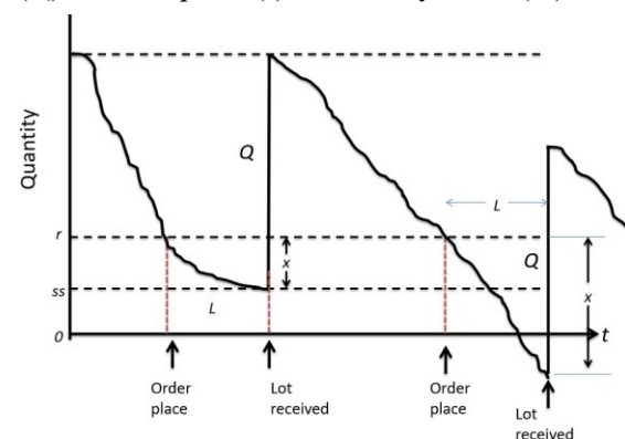
Figure 1. The pattern of inventory levels using the continuous review model

The objective function of the Continuous Review model is the minimization of the expected total cost of inventory per year. Expected total cost of inventory per year (TC) consists of expected cost of purchasing per year (PC), expected cost of ordering per year (OC), expected cost of holding per year (HC), and expected cost of shortage of inventory per year (SC). The decision variables are order lot size (Q), reorder point (r), and safety stock (ss).