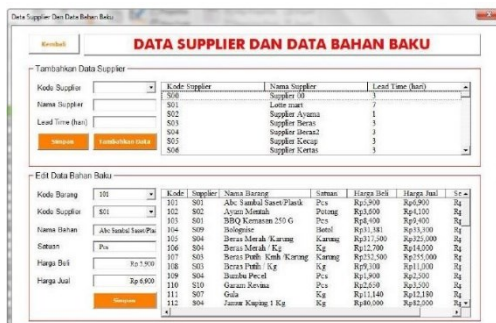
Figure 5. Supplier data